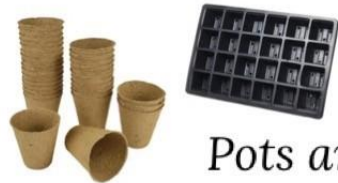
Pots and seed trays

Before you throw away your unwanted items, please consider donating them to Ysgol y Llan.